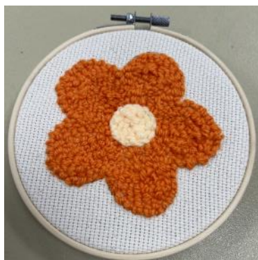
Homemaker members taking advantage of the "Crafting Calm" series held in October.