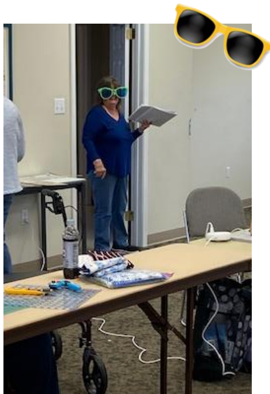
Who needed these copies?

Be sure to send us your pictures of club activities! You can email those to Ronda at: rrex@uky.edu