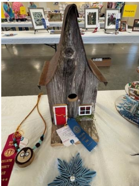
Bill Schwart's Birdhouse received a Blue Ribbon