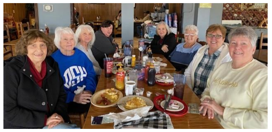
Members of the Back to Basics club enjoyed lunch in Carrollton at Welch's Restaurant in March.